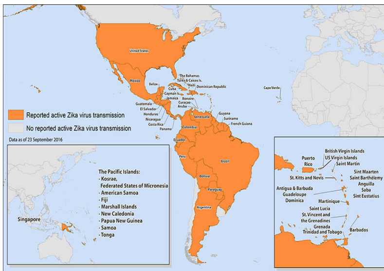
All Countries & Territories with Active Zika Virus Transmission; U.S. Centers for Disease Control and Prevention, November 2016

Since the emergence of Zika in Brazil in 2015, Zika virus has spread rapidly throughout Latin America and the Caribbean. Currently, Zika outbreaks are ongoing in 59 countries and territories, including in Mexico, where the highest numbers of cases are in the southern part of the country. However, the U.S. Centers for Disease Control and Prevention considers any travel to Mexico to be a risk for Zika infection. Individuals have been infected in popular tourist destinations including Cancun, Acapulco, Cabo San Lucas, Puerto Vallarta, Ixtapa, and Mazatlan. While no local transmission has been reported in the border region of Baja California, the mosquitoes that transmit Zika virus are present and local transmission is possible in the region. Active Zika virus transmission in the United States and U.S. territories has only been identified in Miami-Dade County in Florida, Puerto Rico, U.S. Virgin Islands, and American Samoa.